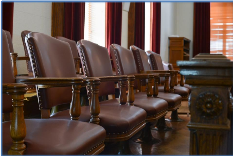
(DENVER CITY & COUNTY BUILDING)

MODEL CRIMINAL JURY INSTRUCTIONS COMMITTEE OF THE COLORADO SUPREME COURT