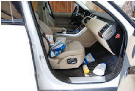
20000911 Carricato (183).JPG 2312K