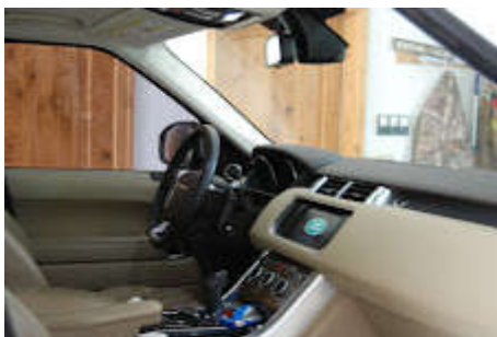
20000911 Carricato (189).JPG 2547K