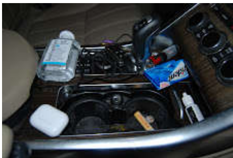
20000911 Carricato (186).JPG 2680K