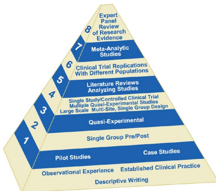
Figure 2: Pyramid of Evidence-Based Practices

The key question in determining whether a practice is evidence based is: What is the strength of evidence indicating that the practice leads to a specific clinical outcome? There is no gold standard for assessing strength of evidence, especially evidence derived from clinical experience. However, COCE has developed a pyramid to represent the level or strength of evidence derived from various research activities. As can be seen in Figure 2, evidence may be obtained from a range of studies including preliminary pilot investigations and/or case studies through rigorous clinical trials that employ experimental designs. Higher levels of research evidence derive from literature reviews that analyze studies selected for their scientific merit in a particular treatment area, clinical trial replications with different populations, and meta-analytic studies of a body of research literature. At the highest level of the pyramid are expert panel reviews of the research literature.